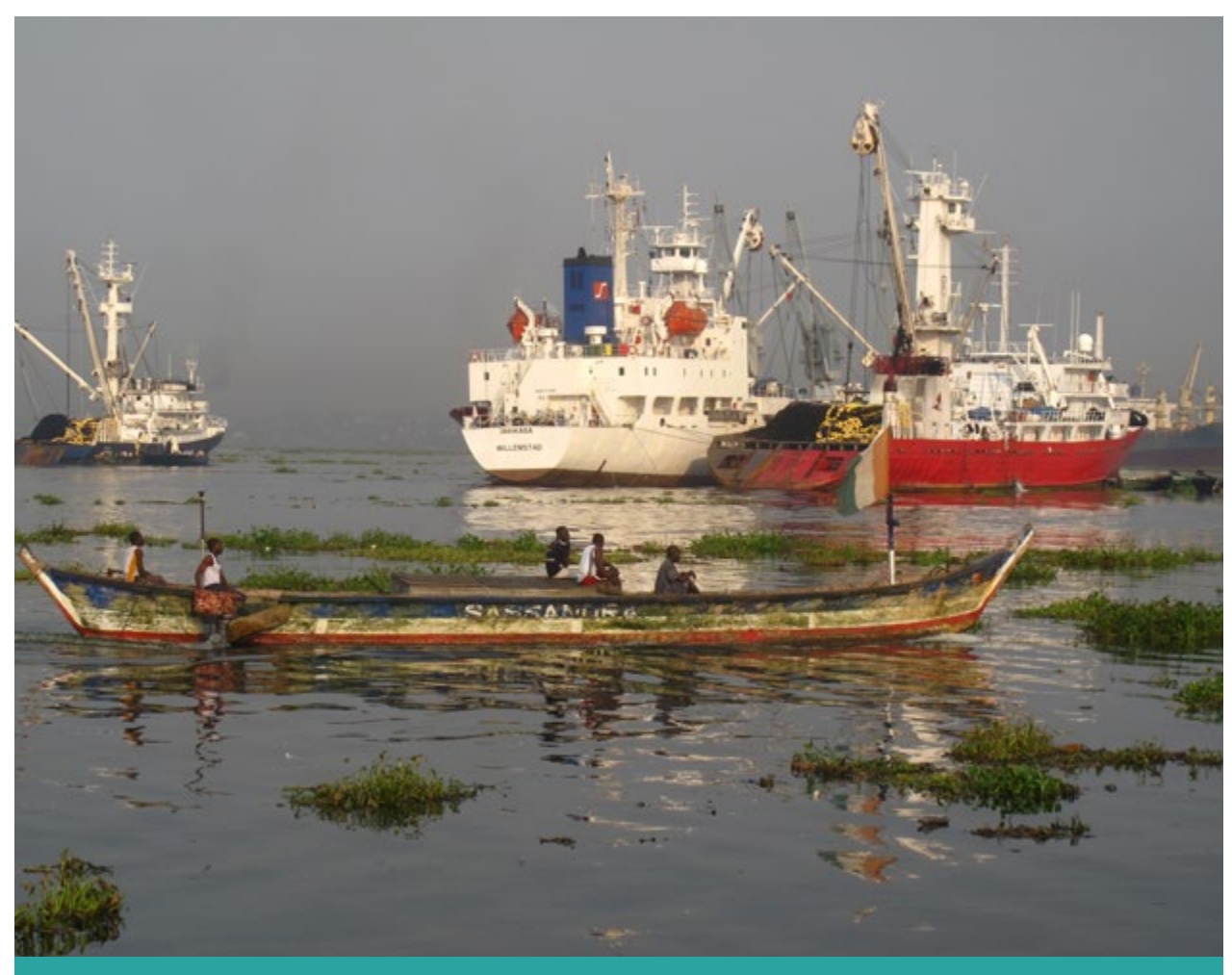
Small-scale and industrial fishing in West Africa

By Patric Fortuno, Apostleship of the Sea, Mauritius.