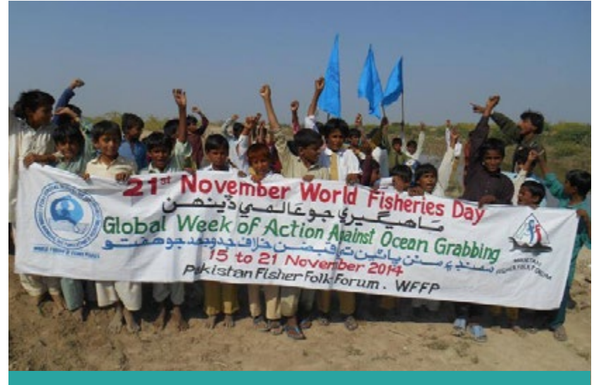
Pakistani fisherfolk on World Fisheries Day